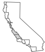
Central Coast Location Map